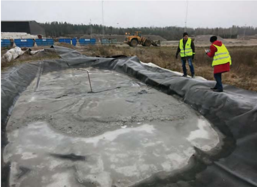
Figure 2: One of the pilot scale tests, see text for details.